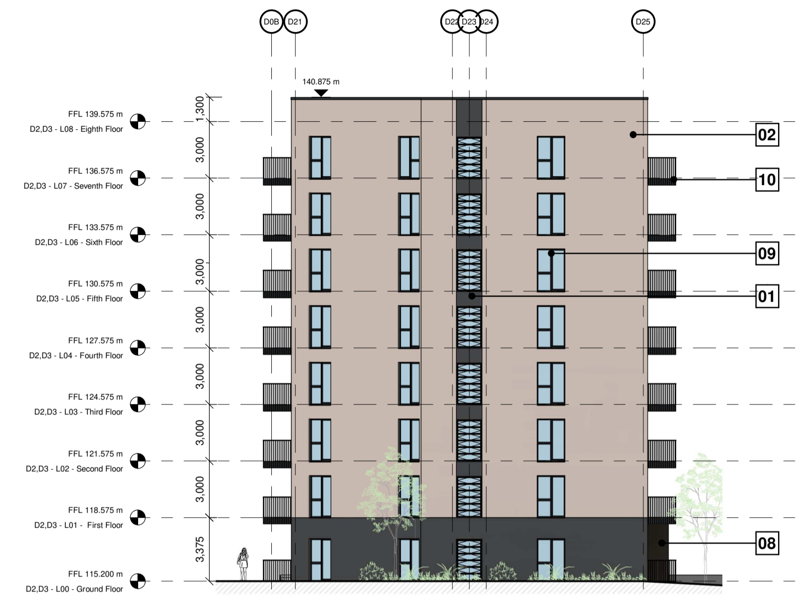
2 PROPOSED ELEVATION - BLOCK D2 - SOUTH 1 : 200