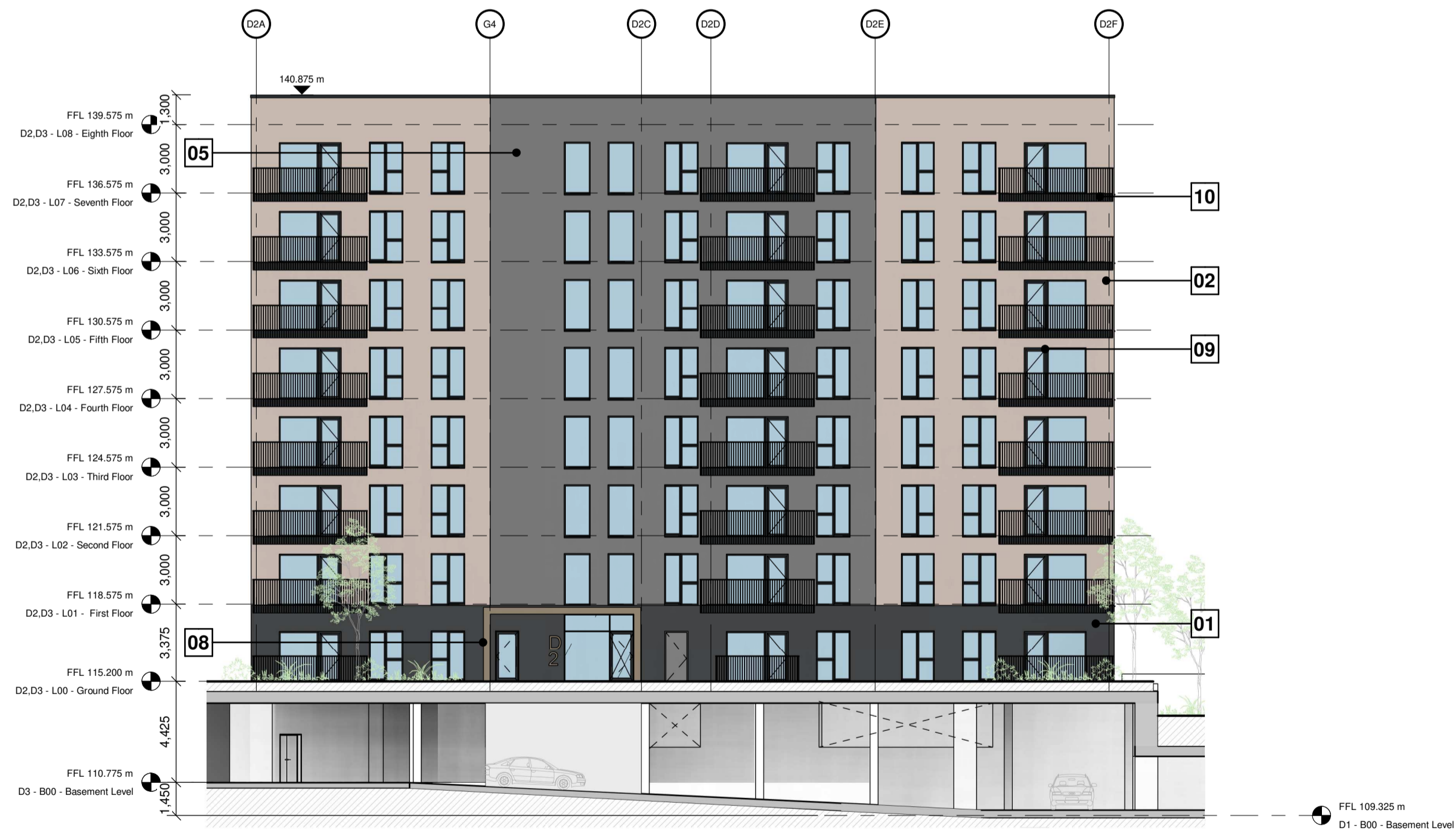
3 PROPOSED ELEVATION - BLOCK D2 - EAST 1 : 200