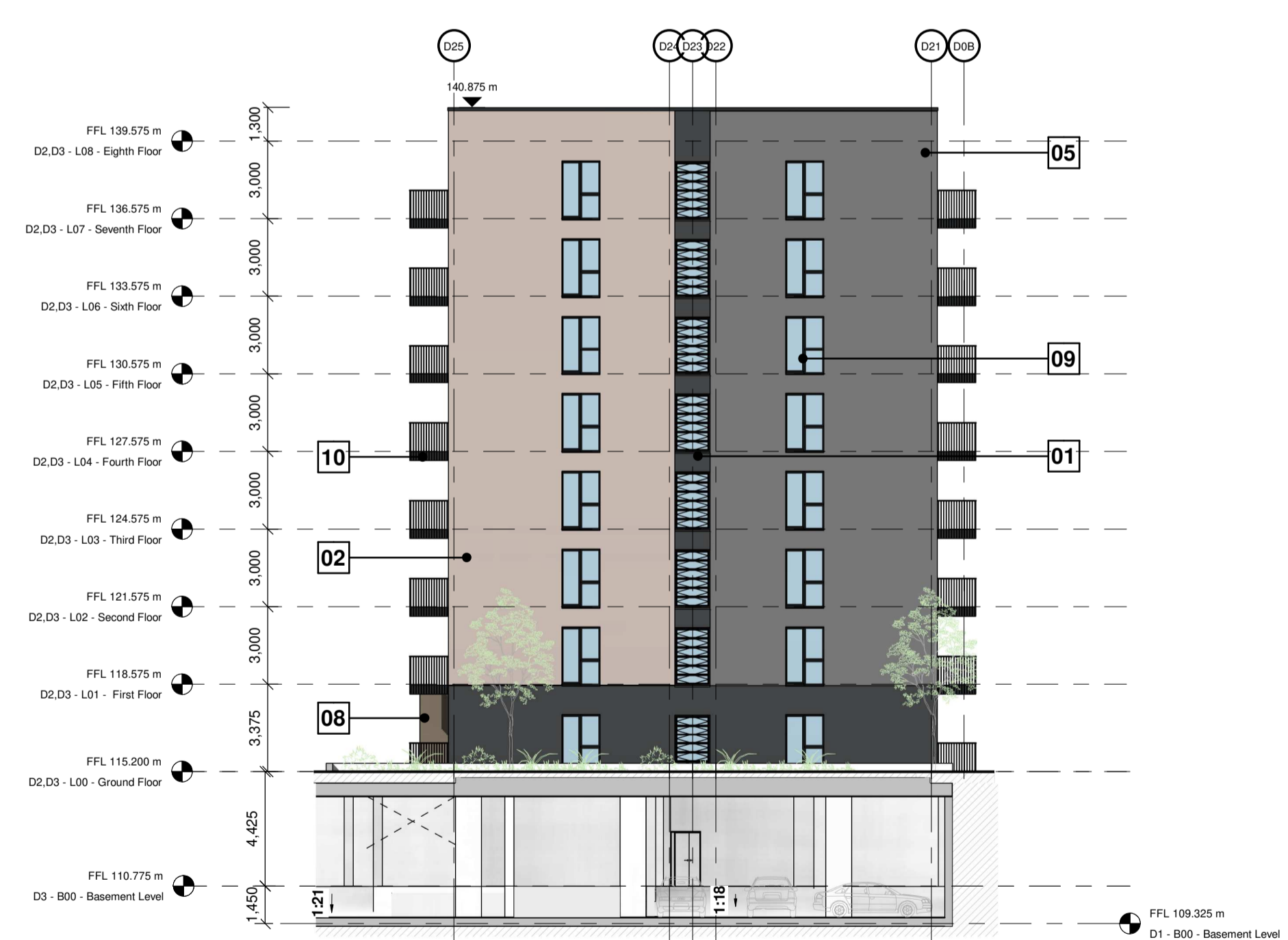
4 PROPOSED ELEVATION - BLOCK D2 - NORTH 1 : 200

Notes: - Do not scale from this drawing. Use figured dimensions in all cases. - Verify dimensions on site and report any discrepancies to the Architect immediately. - This drawing is to be read in conjunction with the Architect's Specification. - © This drawing is copyright and may only be reproduced with the Architect's permission.