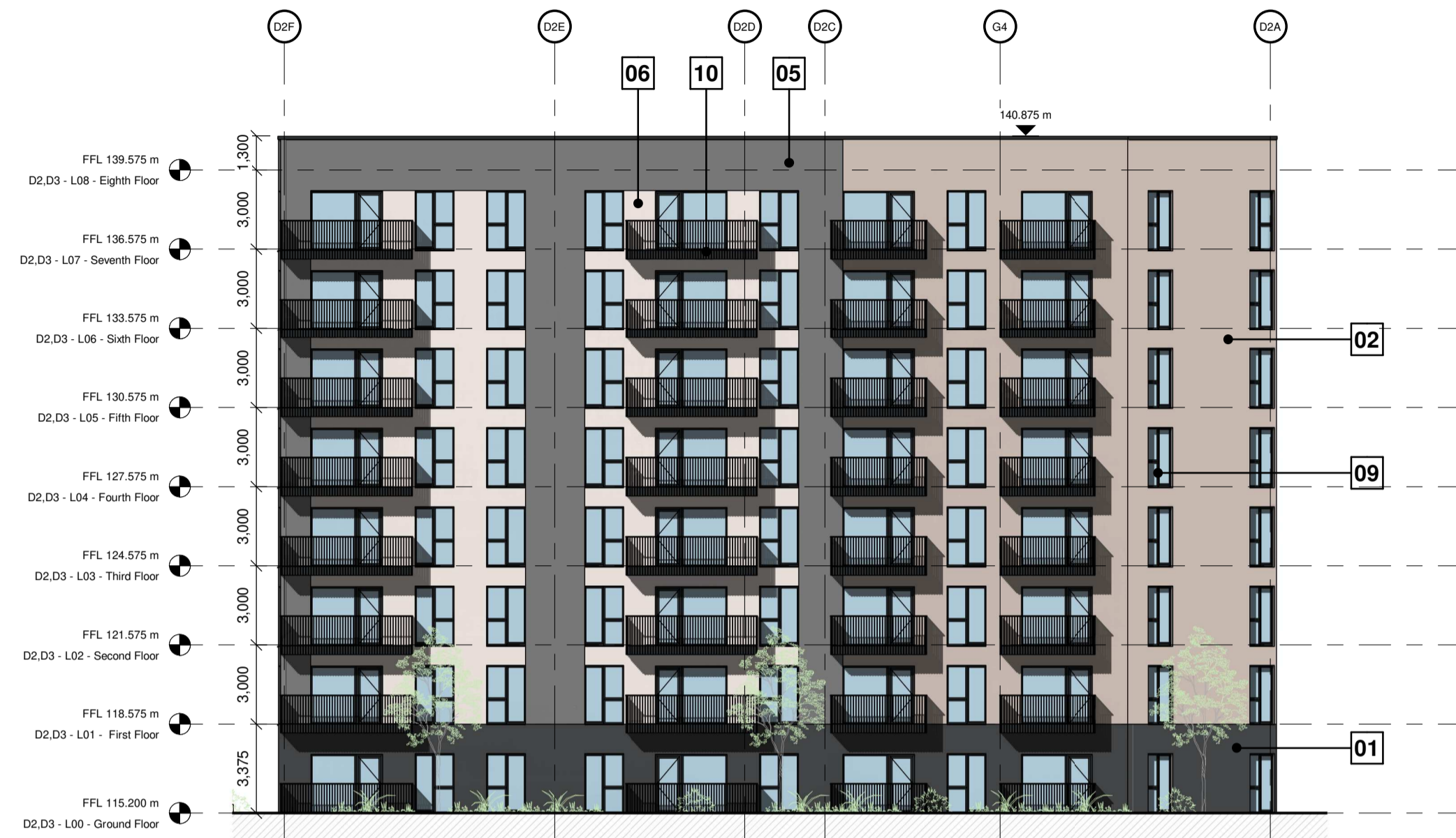
1 PROPOSED ELEVATION - BLOCK D2 - WEST 1 : 200